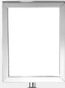
Vertical 8.5" x 11"