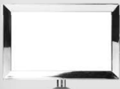
Horizontal 7" X 11"