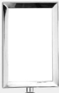
Vertical 7" X 11"

Our Heavy Duty sign frames are manufactured with a 3/4"/19mm wide steel border making them very robust and ideal for heavy traffic environments. Available in 6 post top sizes these frames accept signs up to 1/4"/6mm thick; alternatively two sheets of clear acrylic can be supplied for use with paper signs. The frames have a top opening and the sign simply slides in making replacement easy. Frames for retracting belt barriers are fitted with a post top adapter which slips over the top of the post for a firm fit. Frames for rope stanchions are fitted with a stud and screw directly into the stanchion's tapped top. Adapters and studs are available to fit all major brands of stanchions.