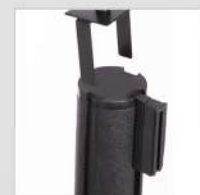
Adaptors to Fit All Major Stanchion Brands