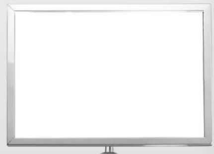
Horizontal 14" X 22"