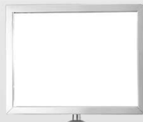
Horizontal 11" X 14"