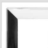
Steel Construction with 3/4"/19mm Border