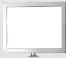
Horizontal 8.5" x 11"