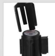
Easy Fit Post Top Adapters for Belt