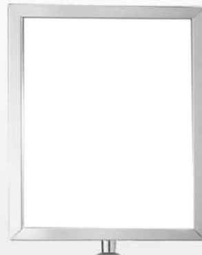
Vertical 11" X 14"