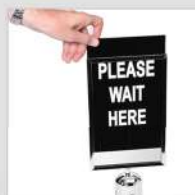
Easy Sign Replacement